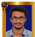
Engineering Excellence Reward