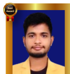
Engineering Excellence Reward