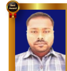
Engineering Excellence Reward

MR. KALIDAS KORE AUDITORIUM PROJECT, ROHA