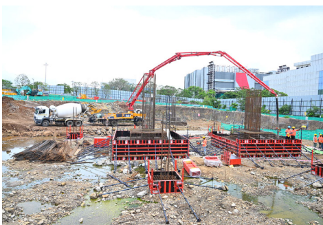
STT GLOBAL DATA CENTRES INDIA PVT. LTD - DIGHI, PUNE.

Recently at STT DC4, started using RMD Rapidshor Framework as it is a heavy-duty galvanised modular steel shoring system with a robust design. Ease of assembly, low cost in use and an extensive range of accessories make it the premier choice in modular shoring; With this technology, it has helped the project team to catalyse performance.