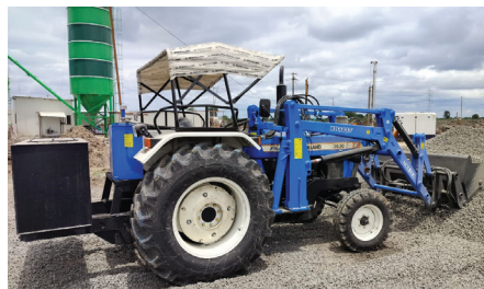
TRACTOR LOADER - 1