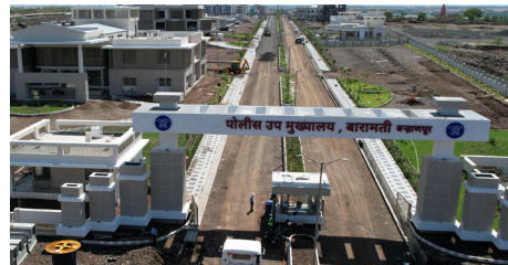
POLICE HEADQUARTER, BARAMATI.