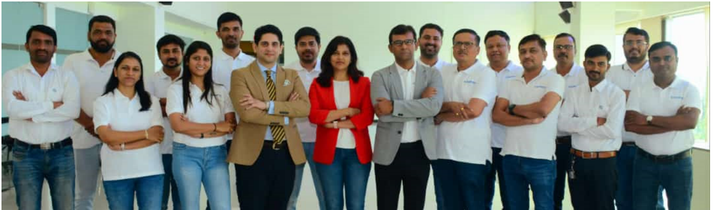
TEAM SHUBHAM BUILDING EXCELLENCE LEAPING FORWARD