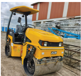
VIBRATORY ROLLER JCB - 1