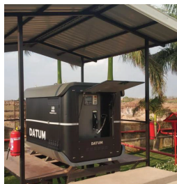
D.G SET 125 KVA - 1

At Shubham EPC, is known for its modern machines & to provide top-quality EPC services as a part of its overall strength, we added a few new machines equipment's i.e. Concrete Batching Plant 30 Cum/Hr (Schwing Stetter) - 11, Tractor Loader - 1, Telehandler JCB - 530-110 - 1, Vibratory Roller JCB - 1, D.G Set 125 KVA - 1 that will increase the efficiency & performance at the project site.