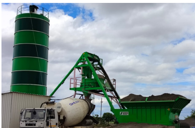
CONCRETE BATCHING PLANT 30 CUM/HR (SCHWING STETTER) - 1

Panels are designed to withstand concrete pressure of 75 KN/Sqm for columns and 60 KN/Sqm for walls. Easy erection with wedge clip for all panel connections and in- built brace connector for connecting the push-pull props. With crane and crane free erection with better productivity.