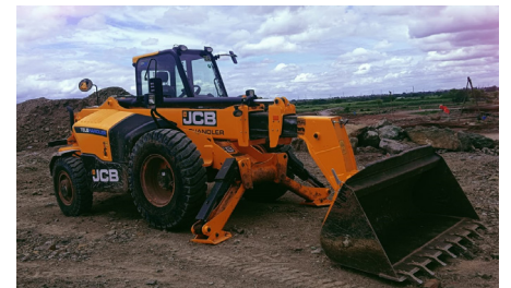
TELEHANDLER JCB - 530-110 - 1