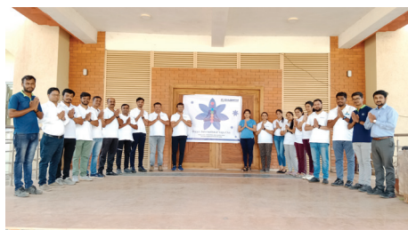
INTERNATIONAL YOGA DAY