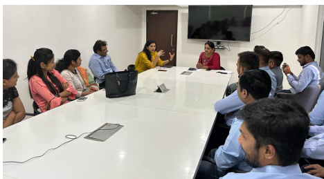
THE POSH COMMITTEE MEETING

We redefined the policy on sexual harassment of women at the workplace i.e. prevention, prohibition & redressal (POSH) Act, 2013 & the POSH committee has being restructured.