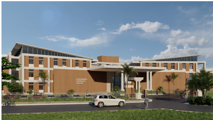
GOVERNMENT AYURVEDIC COLLEGE - BARAMATI, PUNE.