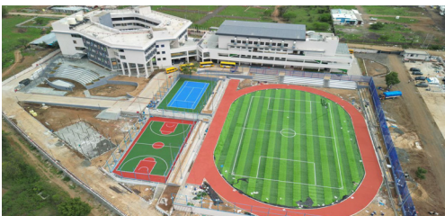
GLOBAL INDIAN INTERNATIONAL SCHOOL, NAGPUR.