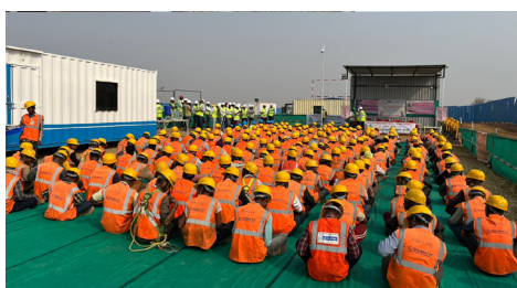
WORKERS MOTIVATIONAL PROGRAM