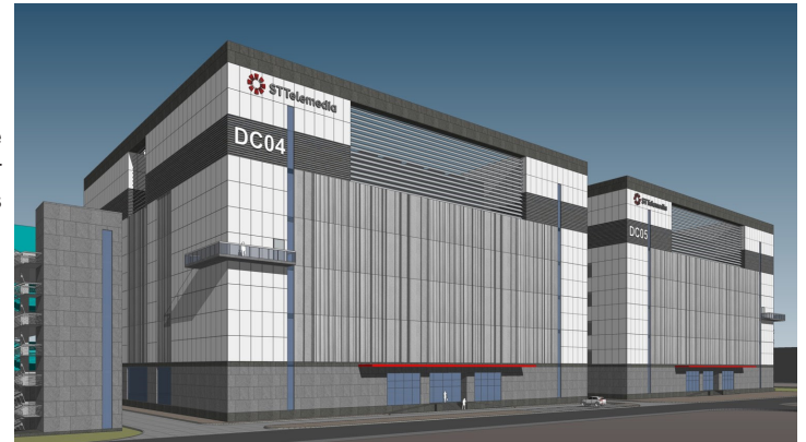
STT GLOBAL DATA CENTRES INDIA PVT. LTD - DIGHI, PUNE.