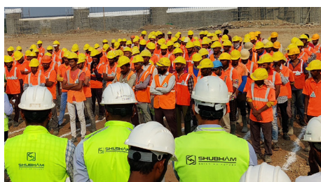
SAFETY SESSIONS FOR WORKERS

Employee welfare is a crucial activity at workplace, we recently executed Cricket Tournaments within Departments, Yoga Sessions at sites on the occasion of International Yoga Day at the office, Workers Safety Programs at all the sites of Shubham EPC.