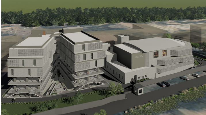
NATYAGRAH AND COMMERCIAL COMPLEX - BARAMATI, PUNE.